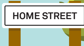
A street sign