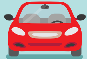
A red car