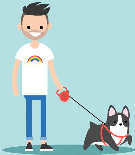
A dog on a walk