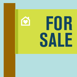
A 'for sale' sign